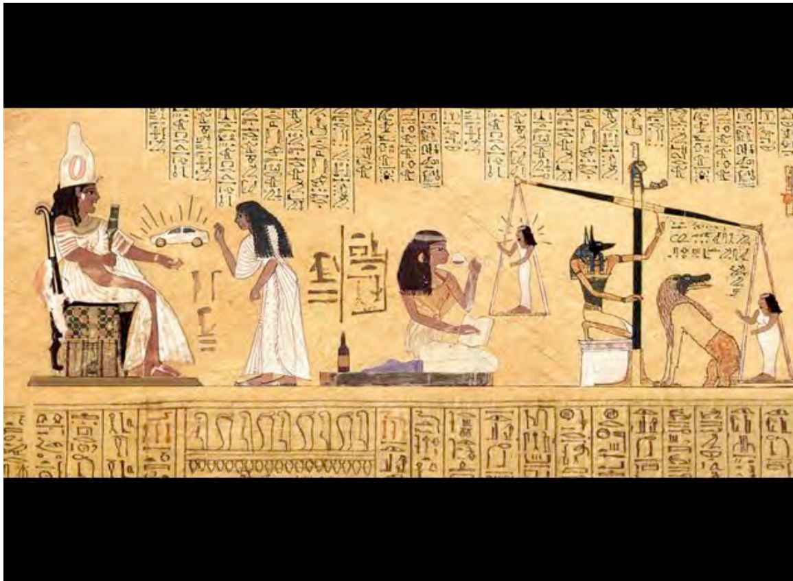
A sample of a Book of the Dead that will accompany the women into eternity.